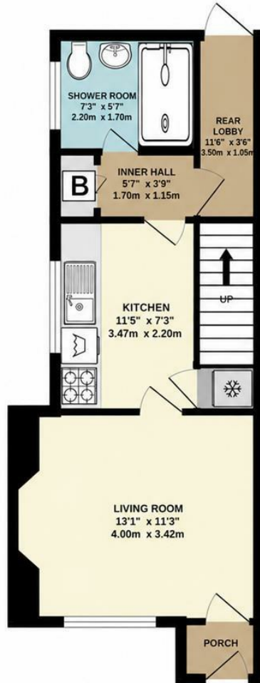
GROUND FLOOR 289 sq.ft. (26.9 sq.m.) approx.